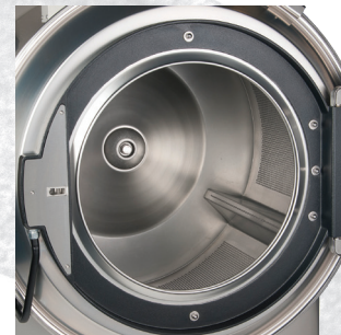
36026 cylinder shown

Milnor's tall rib construction and precise cylinder speeds combine to provide excellent MAF – Mechanical Action Factor – delivering excellent wash quality and reducing time-consuming and costly rewashes.