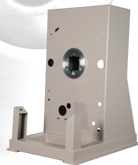
30022 V8Z frame shown

Milnor frames are designed to prevent concentration of stress in one spot and all structural components are tied together for optimum stress dispersion. This proven structural integrity means your machines will last longer.