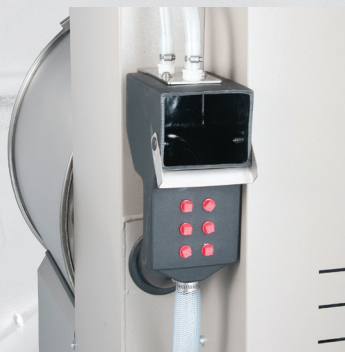
30022 V8Z chemical inlet shown

Chemicals are injected in the rear of the machine (unlike certain brands where chemicals are injected near the front of the machine at eyelevel). Chemicals are diluted and flushed into the sump of the washer-extractor so that raw chemical does not come in direct contact with the linen or the stainless steel.